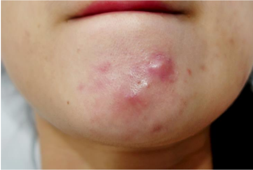
Figure 4: An Example of Cystic Acne:

https://optinghealth.com/wp-content/uploads/2017/07/Cystic-Acne-1-e1503829566899.png