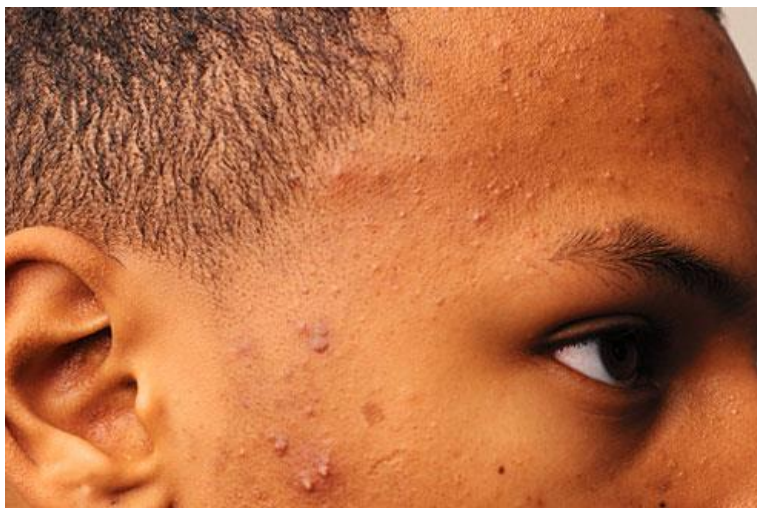
Figure 2b: Moderate Acne:

https://www.webmd.com/skin-problems-and-treatments/acne/ss/slideshow-acne-dictionary