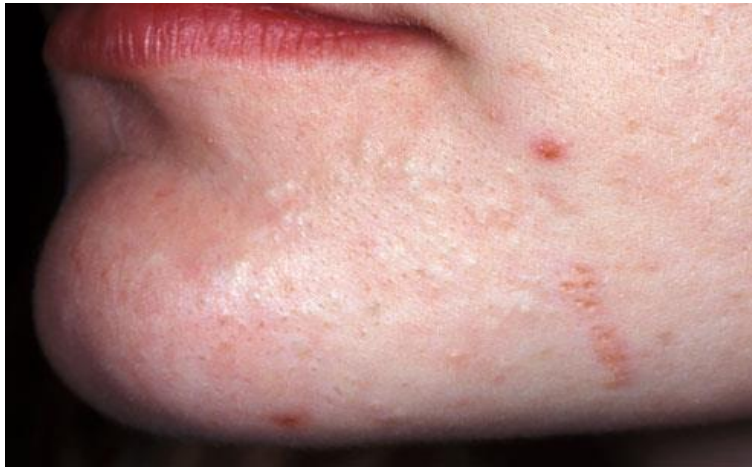
Figure 2a: Mild Acne:

https://www.webmd.com/skin-problems-and-treatments/acne/ss/slideshow-acne-dictionary