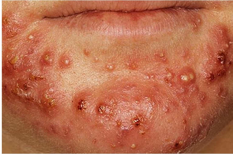
Figure 2c: Severe Nodulocystic Acne:

https://www.webmd.com/skin-problems-and-treatments/acne/ss/slideshow-acne-dictionary